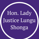
Hon. Lady Justice Lungu Shonga